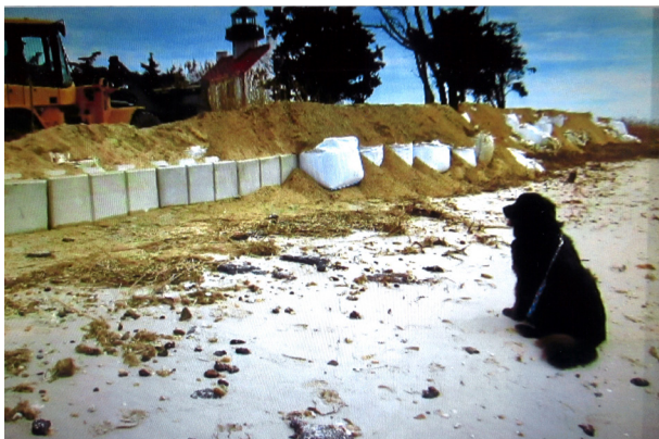
(Above) "Captain" Tidy checking the area